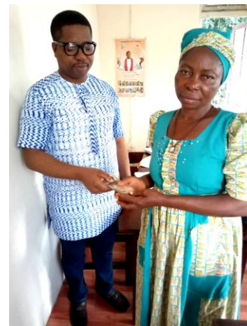
EMPOWERMENT TO BENEFICIARY OF JDPC FREE INTEREST LOAN