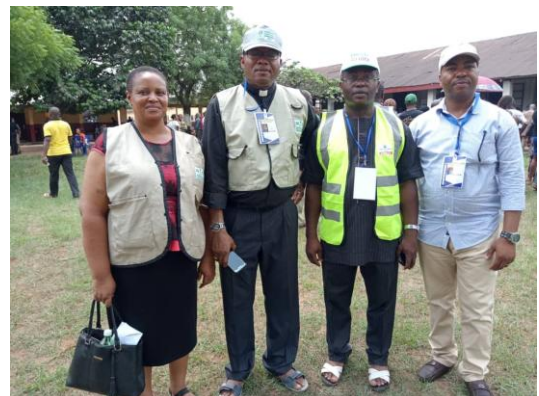
JDPC ELECTION ROVING TEAM