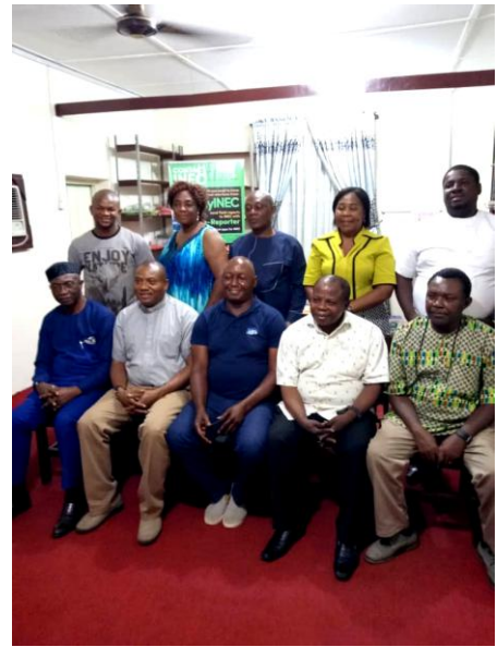
COURTESY CALL FROM ARCHDIOCESAN ENTREPRENEURSHIP BOARD