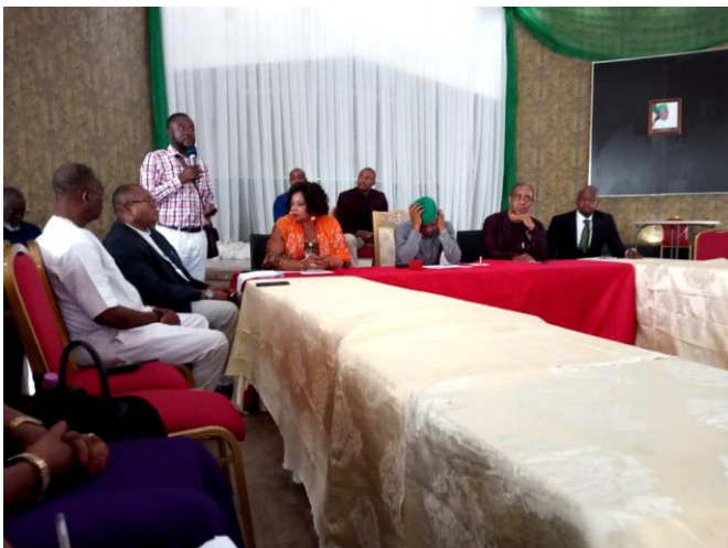
MEETING WITH IMO STATE GOVERNOR, MGT. OF JDPC AND RETURNEES FROM SOUTH AFRICA