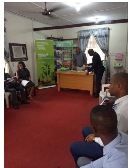
MEETING WITH NIRSAL OFFICIALS FOR AGRICULTURE EMPOWERMENT