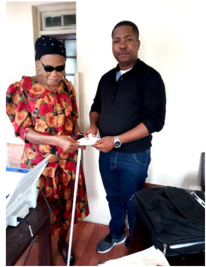
EMPOWERMENT TO BENEFICIARY OF JDPC FREE INTEREST LOAN