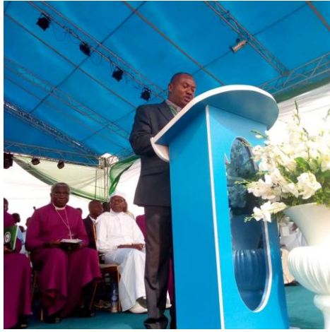
JDPC DIRECTOR GIVING THE VOTE OF THANKS AFTER THE INTERDENOMINATIONAL SERVICE TO MARK THE INAUGURATION OF THIS PRESENT GOVT, RT. HON EMEKA IHEDIOHA