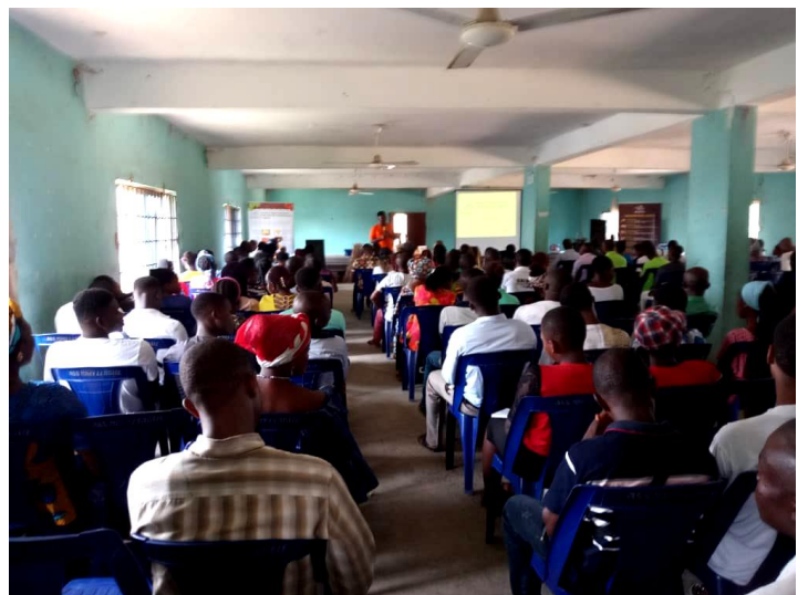
PARTICIPANTS DURING THE IITA TRAINING