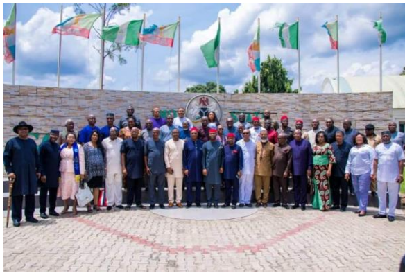
31 MEN INAUGURATION PLANNING AND HAND OVER COMMITTEE