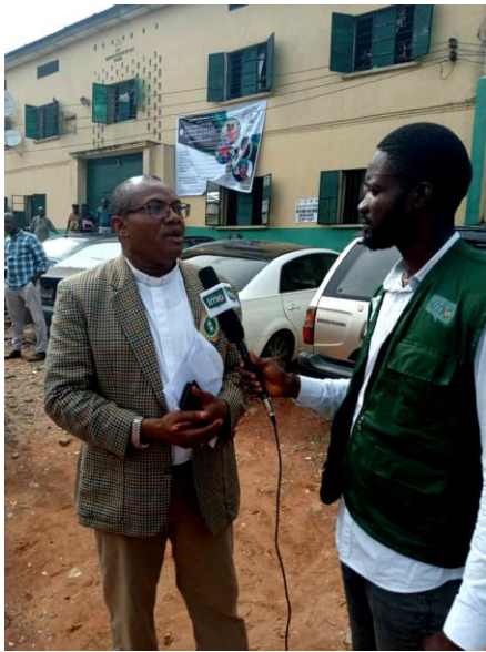
PRESS INTERVIEW AFTER THE PROGRAM AT IMO STATE CORRECTIONAL CENTER