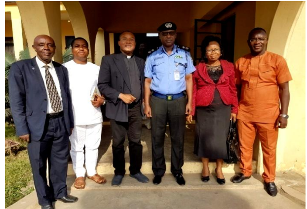
Courtesy Visit to Imo State Commissioner of Police on the need to remain Non-Partisan during the forthcoming 2019 General Elections