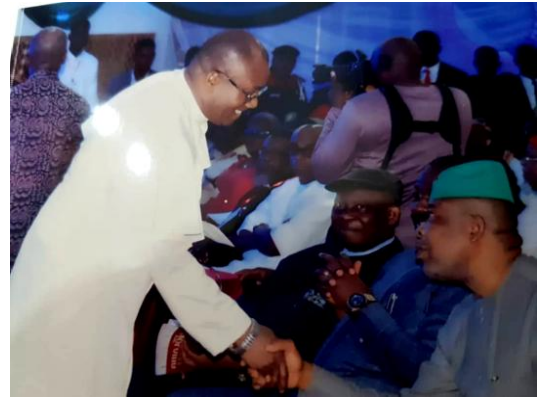
JDPC DIRECTOR EXCHANGING PLEASANTRIES WITH THE IMO STATE GOVERNOR IN THE 2019 AHIANJOKU FESTIVAL