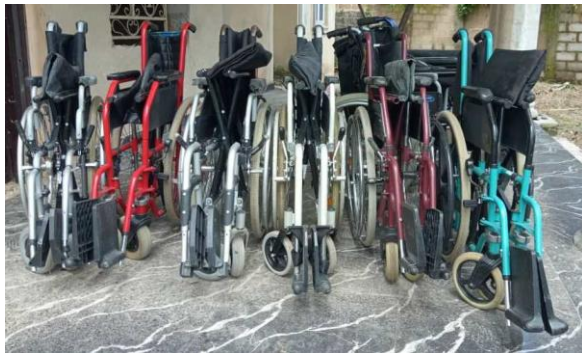
WHEEL CHAIRS TO BE DISTRIBUTED TO THE AMPUTEES IN OWERRI ARCHDIOCESE