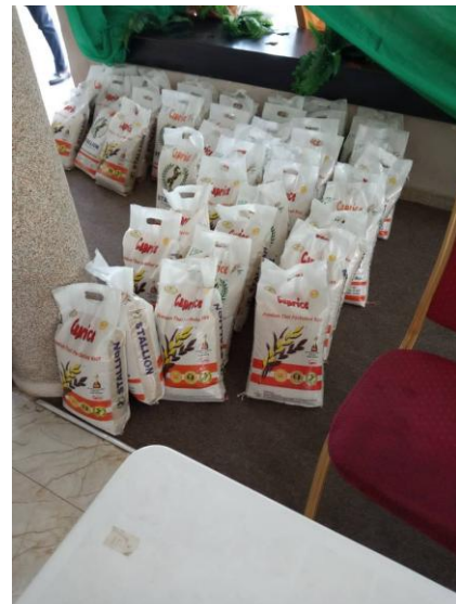
BAGS OF RICE SHARED TO THE SOUTH AFRICA RETURNEES