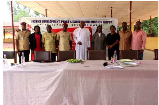
SEMINAR ON GOOD GOVERNANCE