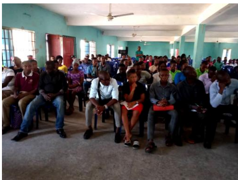
TRAINING SESSION OF JDPC ELECTION OBSERVERS