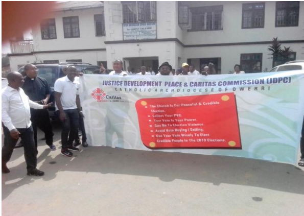
JDPC Road Show Sensitization/Advocacy on peaceful election in Imo State.